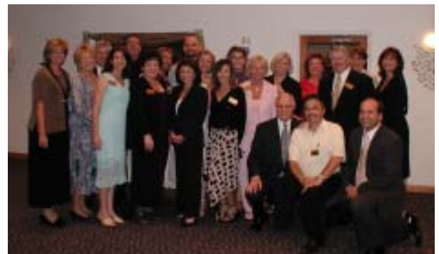
Foundation Board of Directors 2004-05 (not all members pictured)