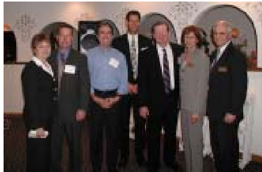
Center Board of Directors 2004-05 (not all members pictured)