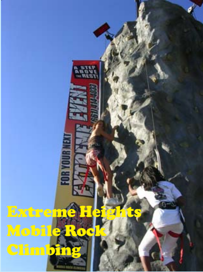
Extreme Heights Mobile Rock Climbing