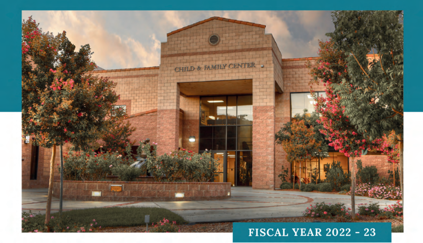
AWARDS & RECOGNITION

CHILD & FAMILY CENTER IS PROUD TO HAVE BEEN RECOGNIZED FOR THE FOLLOWING: